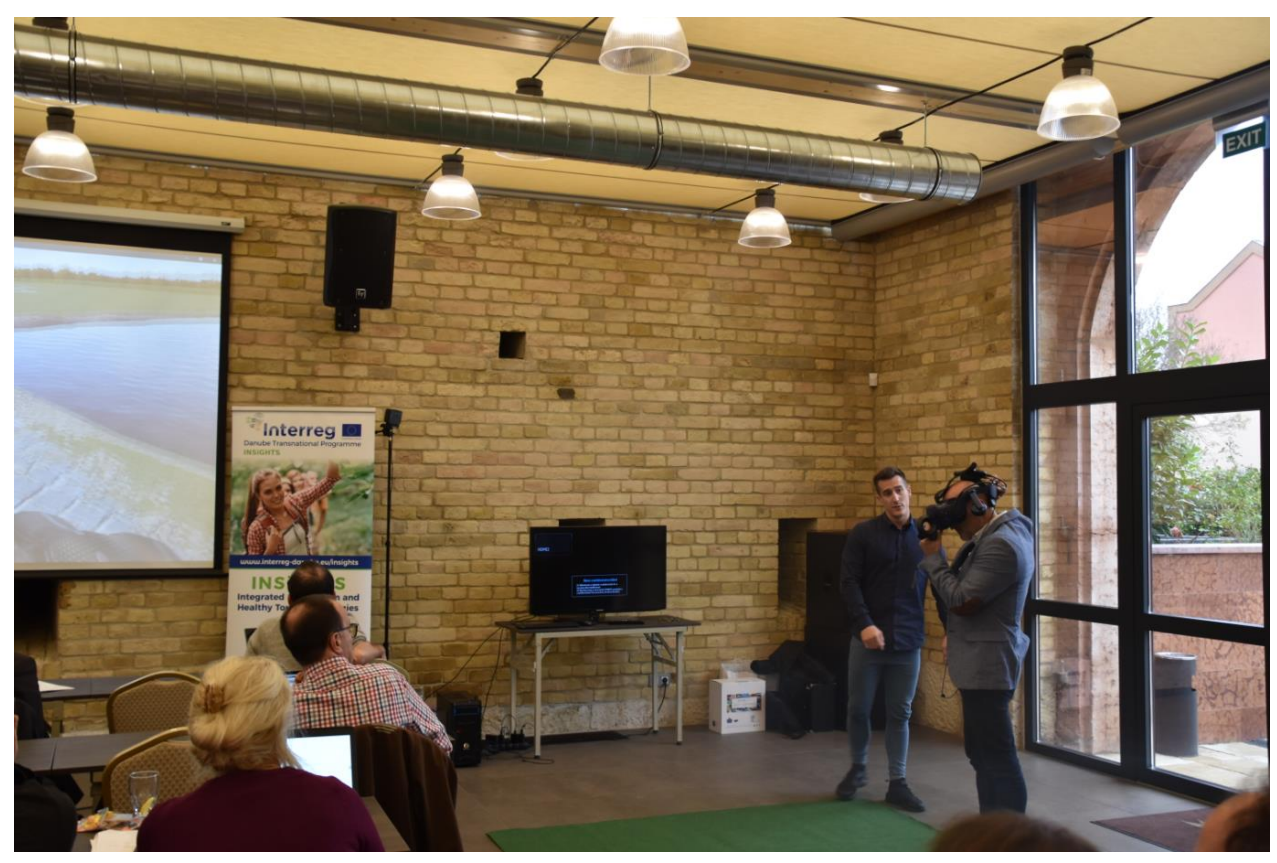
Presentation of Virtual reality tour of the fortress.