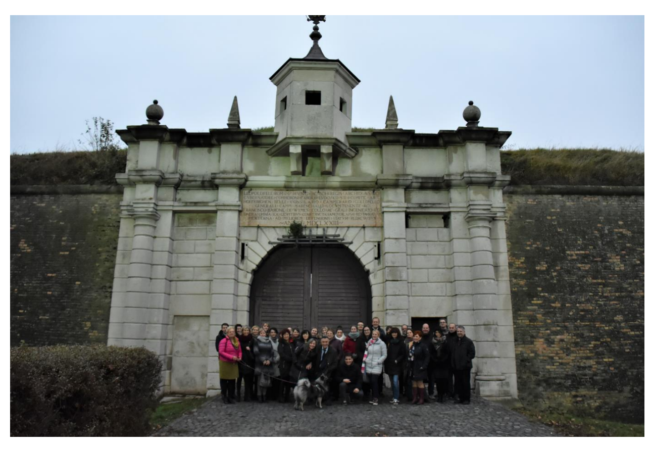
INSiGHTS partners in front of the fortress.